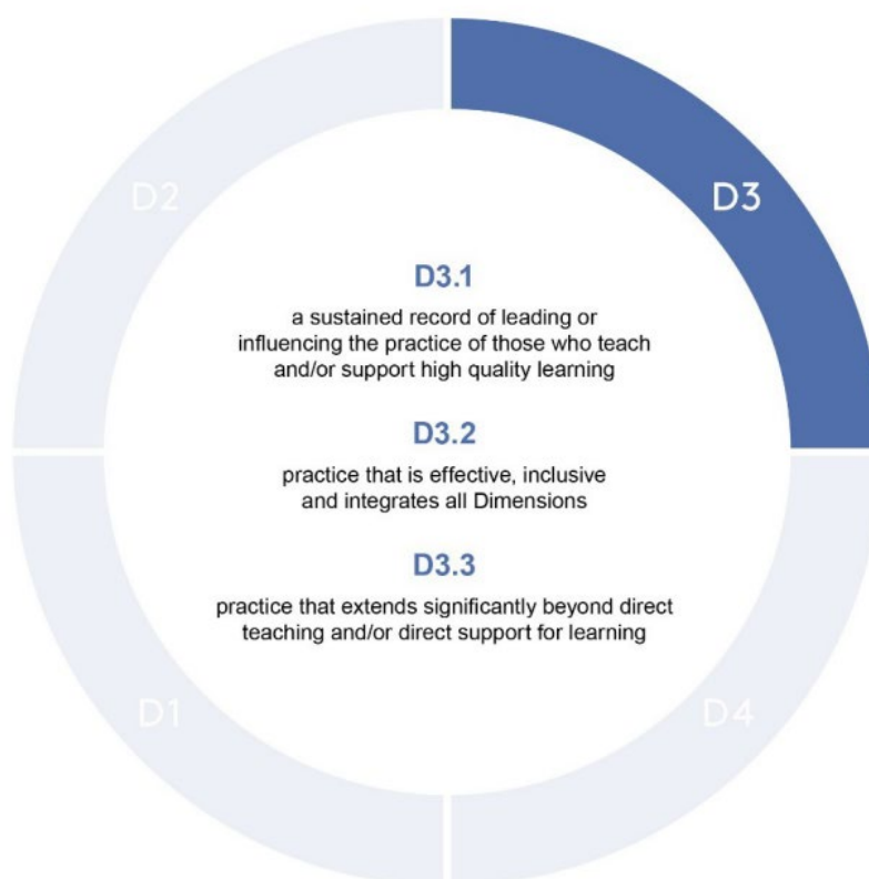
Figure 2: PSF 2023 Descriptor 3 showing the three Descriptor 3 criteria statements

D3 is suitable for individuals whose comprehensive understanding and effective practice provides a basis from which they lead or influence those who teach and/or support high-quality learning. Individuals are able to evidence: