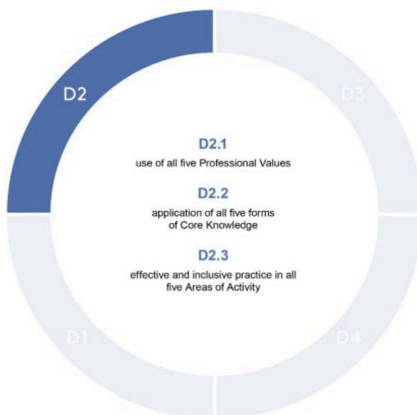
Figure 2: PSF 2023 Descriptor 2 showing the three Descriptor 2 criteria statements D2.1, D2.2 and D2.3

Descriptor 2 is suitable for individuals whose practice enables them to evidence all Dimensions. Effectiveness of practice in teaching and/or support of learning is demonstrated through evidence of: